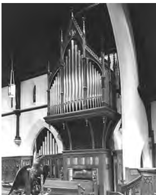
Op. 28 - Burlington, North Carolina