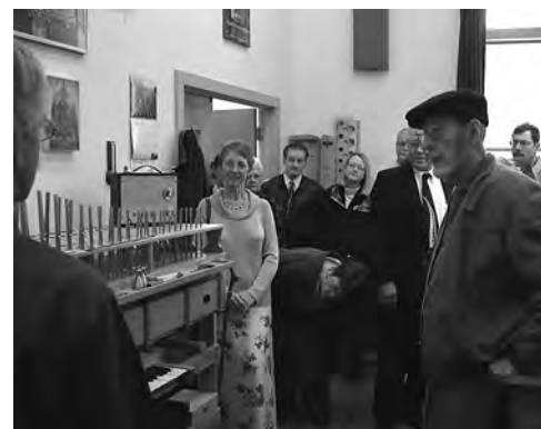
Bill Ayers explains the voicing process