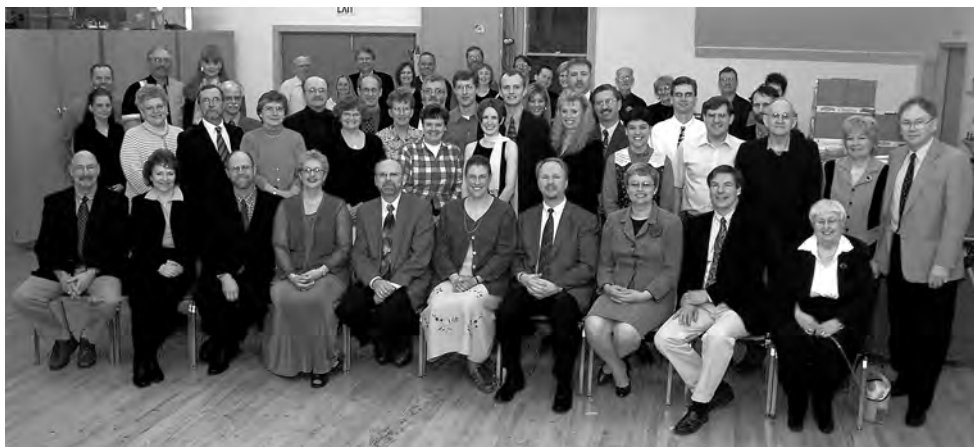
Past and present employees and spouses after dinner