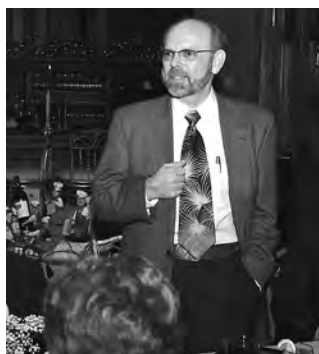
The President reminisces