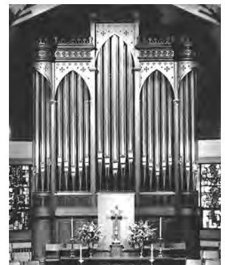
Op. 50 - Minneapolis, Minnesota