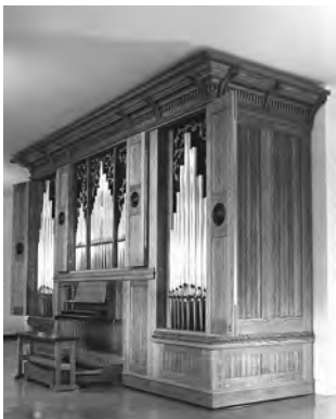
Op. 10 - Mankato, Minnesota