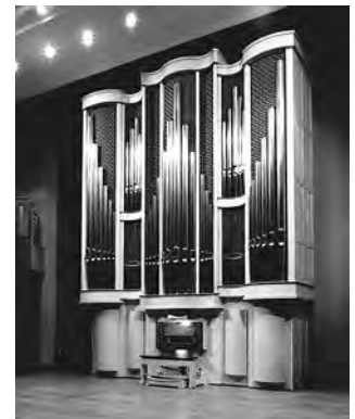
Op. 65 - Columbia, South Carolina