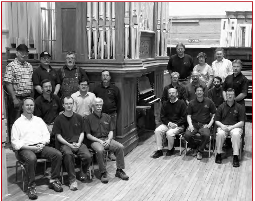
THE DOBSON CREW, MARCH 2004

Each person contributes a special skill or talent to our work. We learn things from each other and learn totally new things together. Everyone takes great pride in what they do and how the organs turn out. One of the most rewarding things for me is the crew's team spirit during organ installations. Our clients often comment about the close, courteous and playful atmosphere