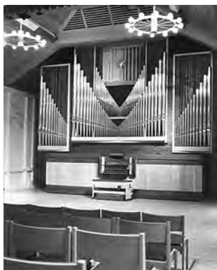
Op. 29 - Northfield, Minnesota