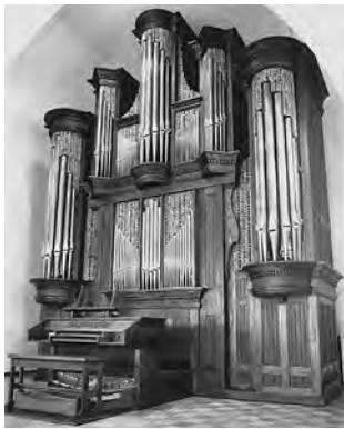
Op. 4 - St. Paul, Minnesota