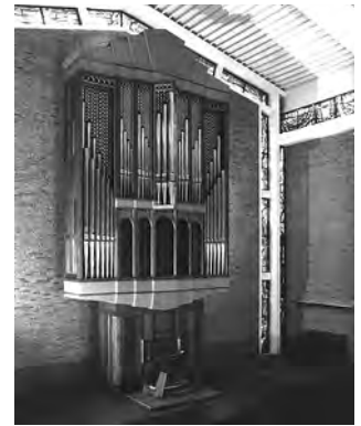
Op. 55 - Storm Lake, Iowa

2004 ~ In its 30th anniversary year, Dobson is busy designing and building organs to be delivered within the next few years, Op. 80 (II/26), for St. Paul's Episcopal Church, Washington, D.C., will be installed in late spring. The second phase of the installation of Op. 76 (IV/126) in Verizon Hall will take place over the summer, and Op. 79 (II/23), for Shepherd of the Bay Lutheran Church, Ellison Bay, Wisc., is scheduled for completion in the fall. Design work includes another significant concert hall instrument, this time for the new Symphony Center in Atlanta, Ga., designed by architect Santiago Calatrava of Zürich, Switzerland. Several additional contracts for projects in Pennsylvania and North Carolina have the firm booked through the end of this decade.